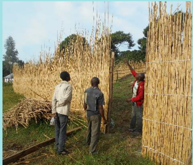
Building the reed fence