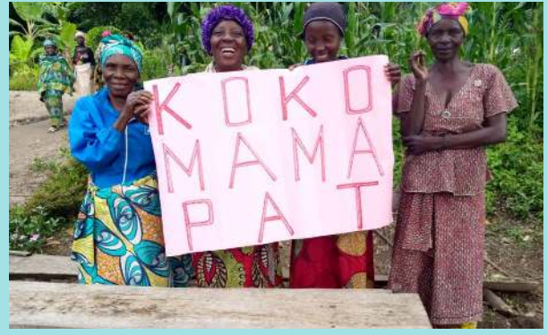
The locals express their gratitude