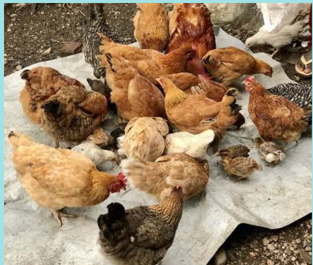
The baby chicks