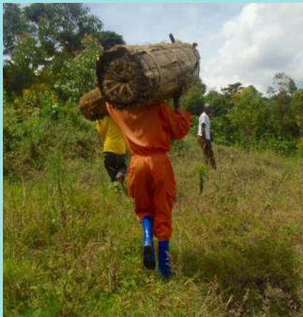
Taking the hives to their new homes in the trees