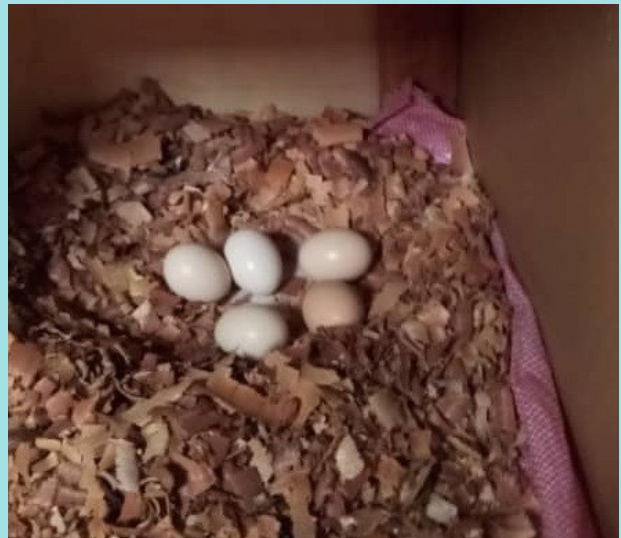
Hatching the eggs