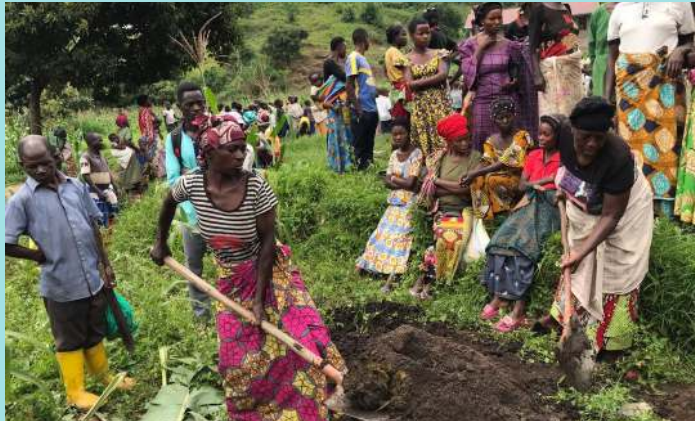
Goma and Idjwi women working together on the agricultural project