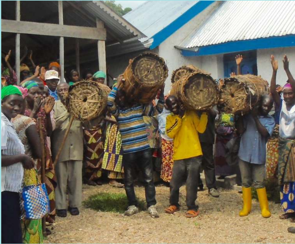
Setting out from the village with new beehives

Beekeeping has long been practised on Idjwi island, and honey was a vital source of nutrition and medicine, but a dramatic increase in population, especially after the Rwanda genocide brought thousands of refugees to the island, plus devastating deforestation, and expulsion of the indigenous pygmies from the forests, has had a detrimental effect on the production of honey and other bee by-products. Our beekeeping project aims to restore the traditional skills and practice of beekeeping, to improve the well-being of the people, and to contribute to the ecosystem and biodiversity of the area.