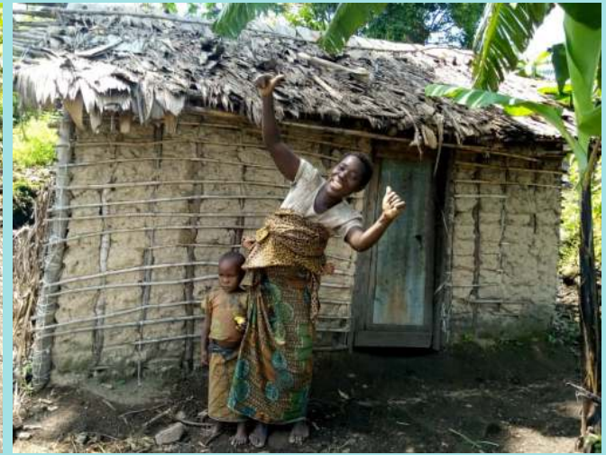
Outside their huts