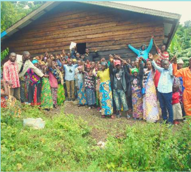
The local people are delighted by the chickens.