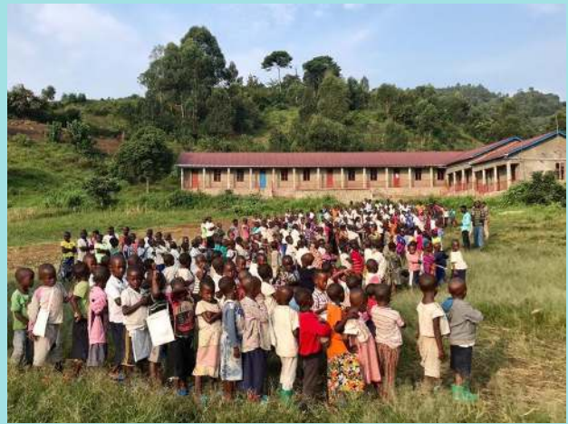
The new school